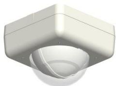
Privacy Protecting mode

SITUCON lets you put cameras where they couldn't be placed before while still providing a comfortable and acceptable environment. As SITUCAM Privacy Protecting Cameras remain disabled, with "eye lids" closed, during normal everyday conditions, privacy concerns are no longer an issue. SITUCON'S PRIVACY PROTECTING TECHNOLOGY allows you to provide both privacy for individuals during the day and have complete property protection at night.